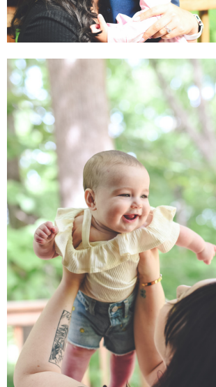
Lives saved because of the ministry of Salem Pregnancy